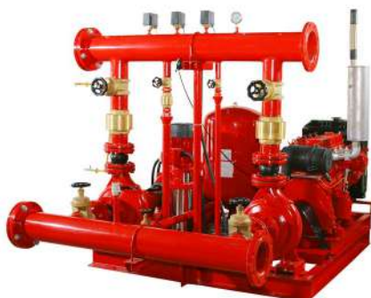
FIRE PROTECTION PUMPS