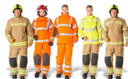
PPE COVERALL & EQUIPMENTS