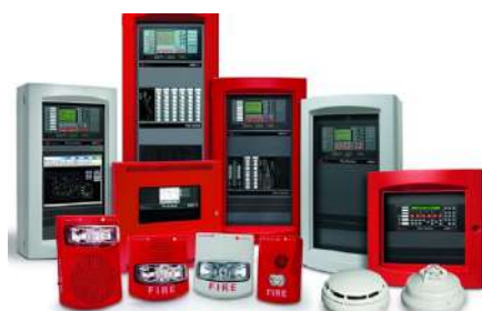
FIRE ALARMS SYSTEMS