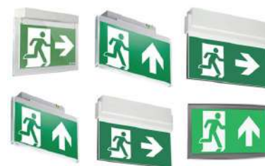
EMERGENCY EXIT SYSTEM