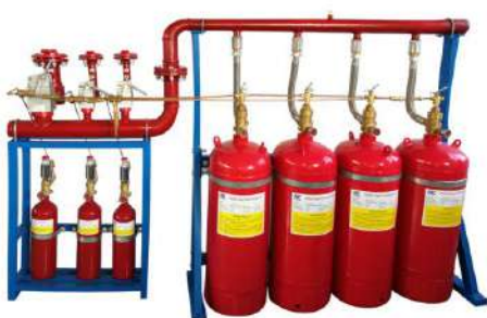
FM 200 SYSTEM