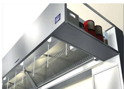
KITCHEN HOOD SUPPRESSION