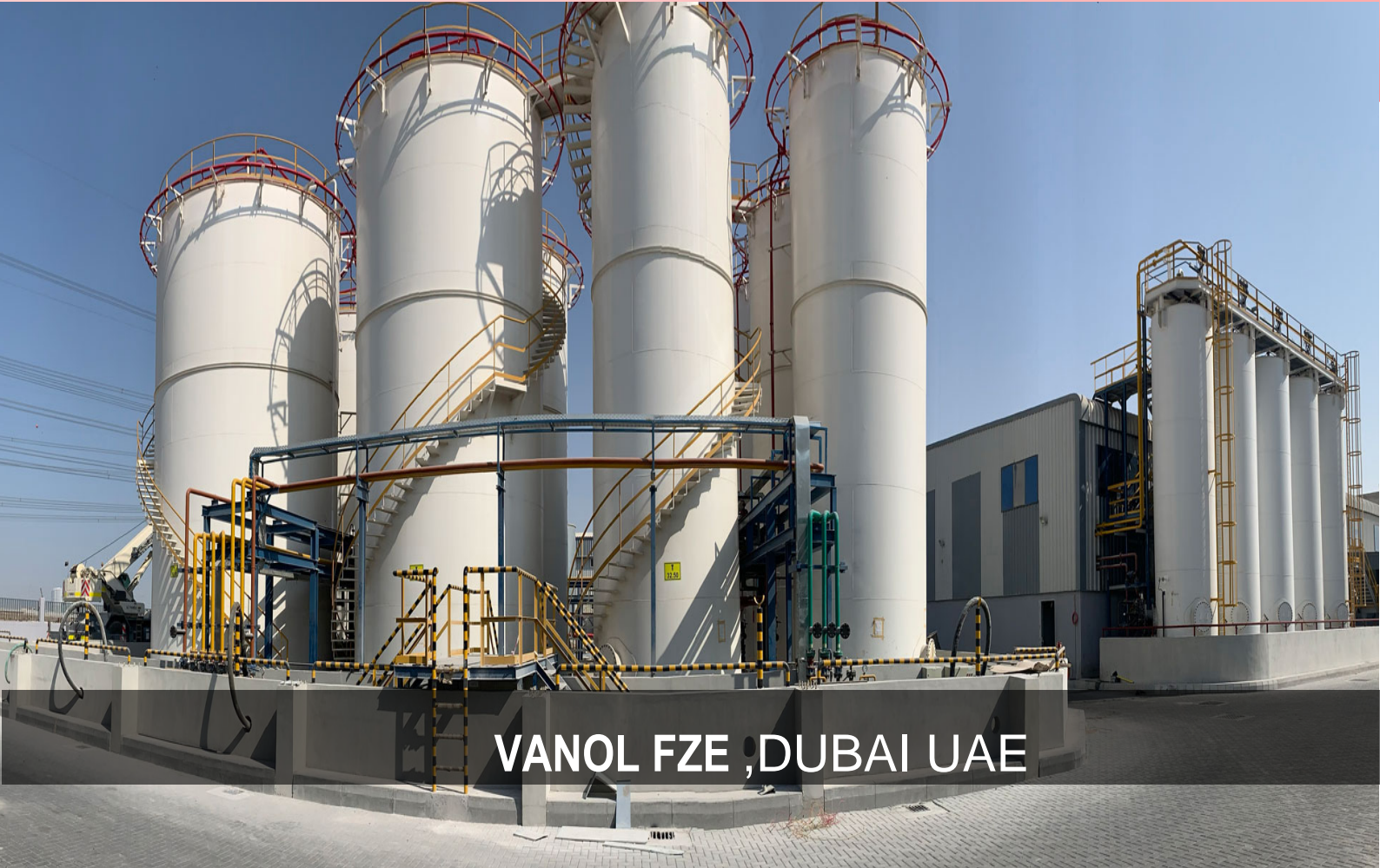
VANOL FZE ,DUBAI UAE