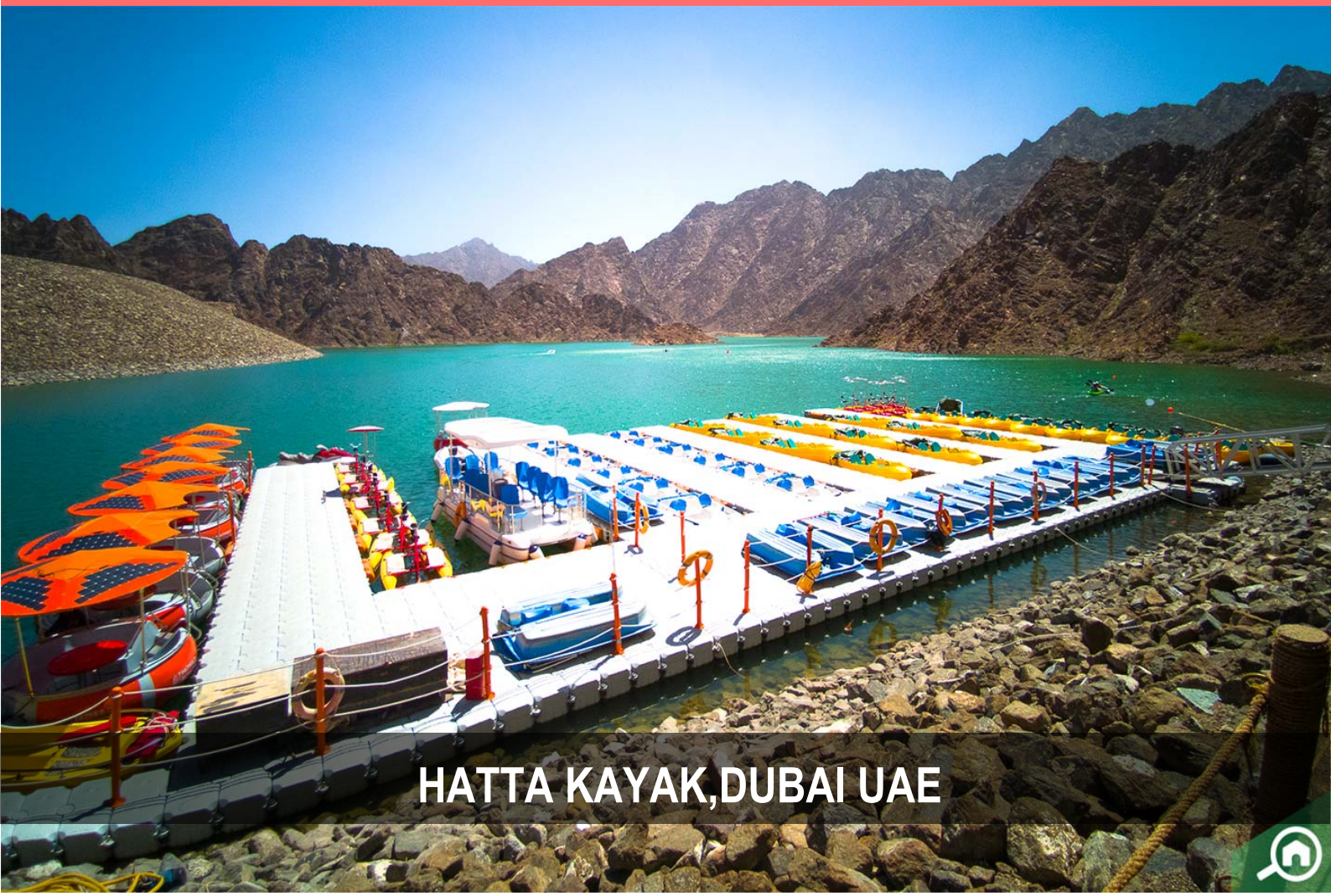
HATTA KAYAK,DUBAI UAE